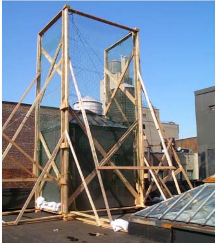
17 West 17th Street Rooftop Garden - Current