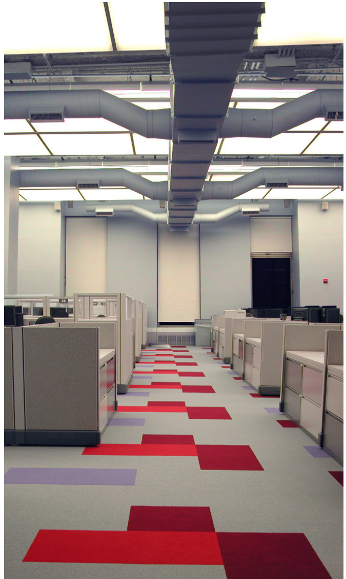
311 Call Center - Completed 2001.